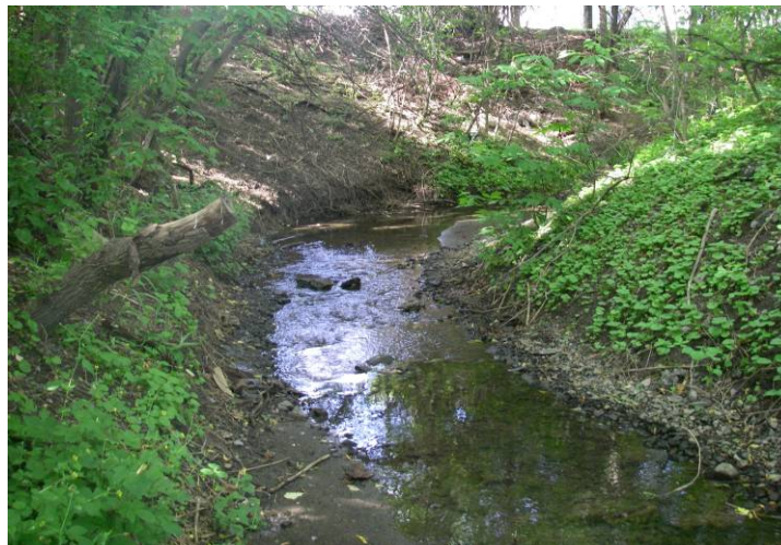
Photo 4 Looking downstream from the middle section of the unnamed tributary near Belle Park.

The second channel was located on the west side of the Cataraqui River and runs from south to north on the north side of Belle Park. The channel consisted of a slow moving channel choked with reed canary grass on the upstream end changing to a shallow rocky channel with riffles in the middle and ending as a slow moving cattail channel at the confluence with the Cataraqui River. Communications with CRCA indicated that they had reviewed this watercourse previously and determined that it provided fish habitat for forage fish (Personal Communications, Tom Beaubiah).