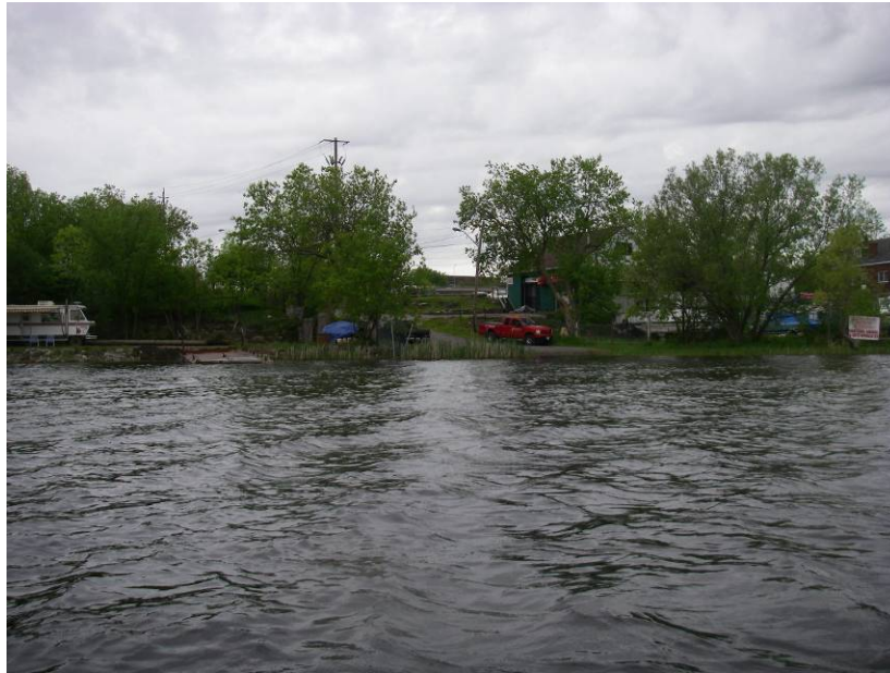
Photo 2 An example of developed western shoreline of the Cataraqui River, May 22, 2009.