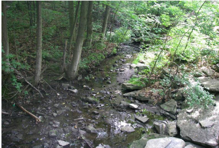
Photo 3 Looking upstream at Butternut Creek.