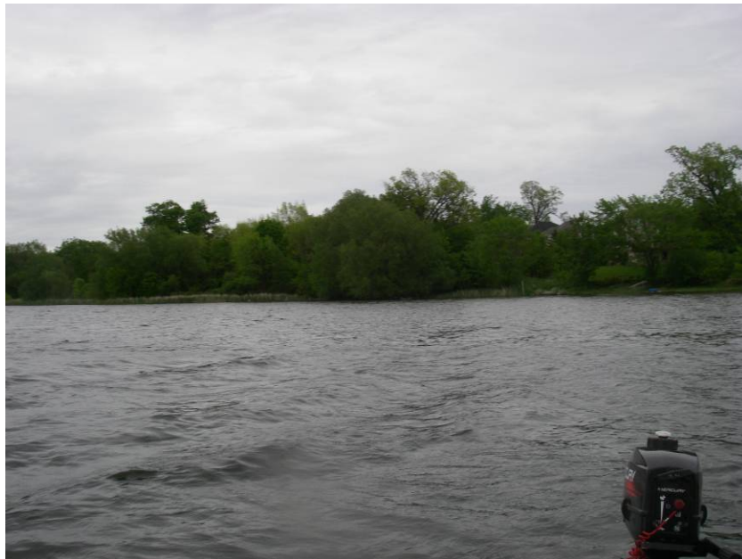
Photo 1 An example of fully vegetated eastern shoreline of the Cataraqui River, May 22, 2009.

Some examples of the vegetation found along the shoreline include: American elm, crack willow, Manitoba maple, sugar maple, oak, honeysuckle, European buckthorn, common cattail, common burdock, staghorn sumac, wild carrot, riverbank grape, sweet clover, and reed canary grass (Photo 1). A more thorough visit will be made later in the growing season.