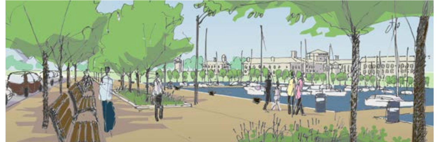
Waterfront promenade along the west side of the Harbour looking towards the former Penitentiary