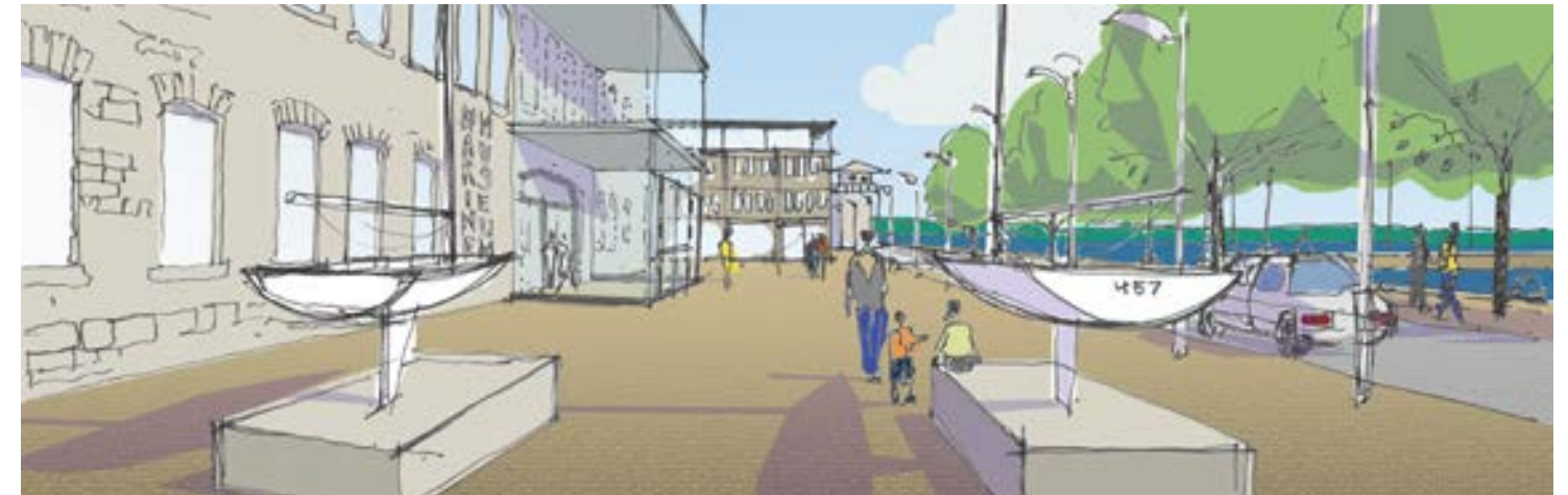
Adaptive re-uses of the former Penitentiary buildings can spill out into adjacent public spaces