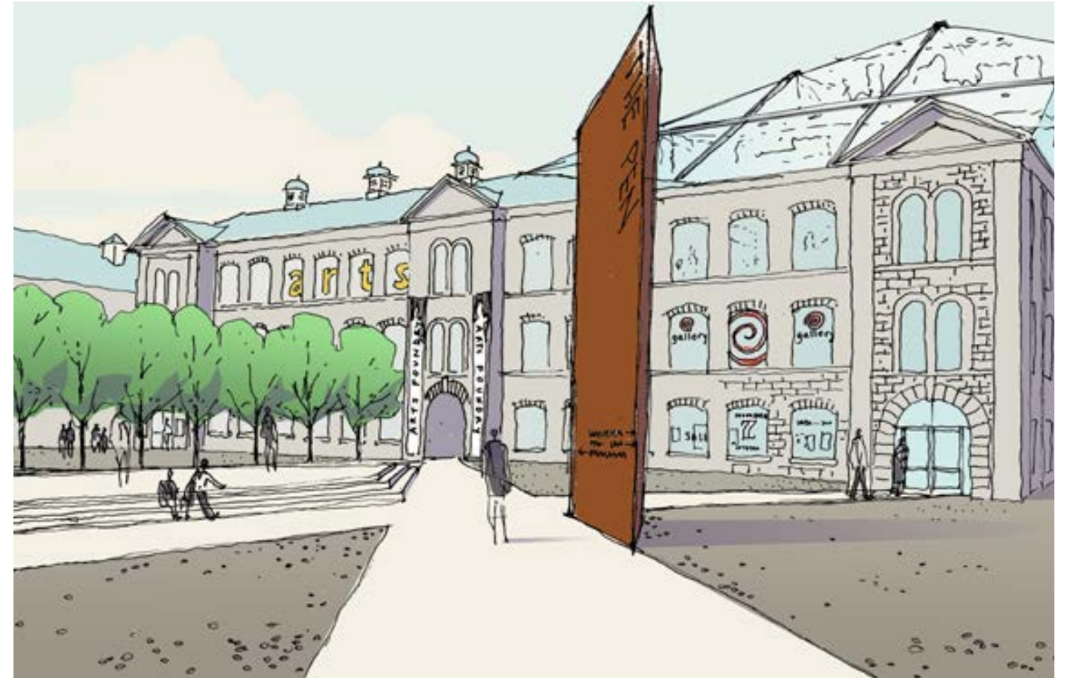
Flexible, programmable space within the former Penitentiary, with adaptive re-use for tourism and commercial uses of heritage structures