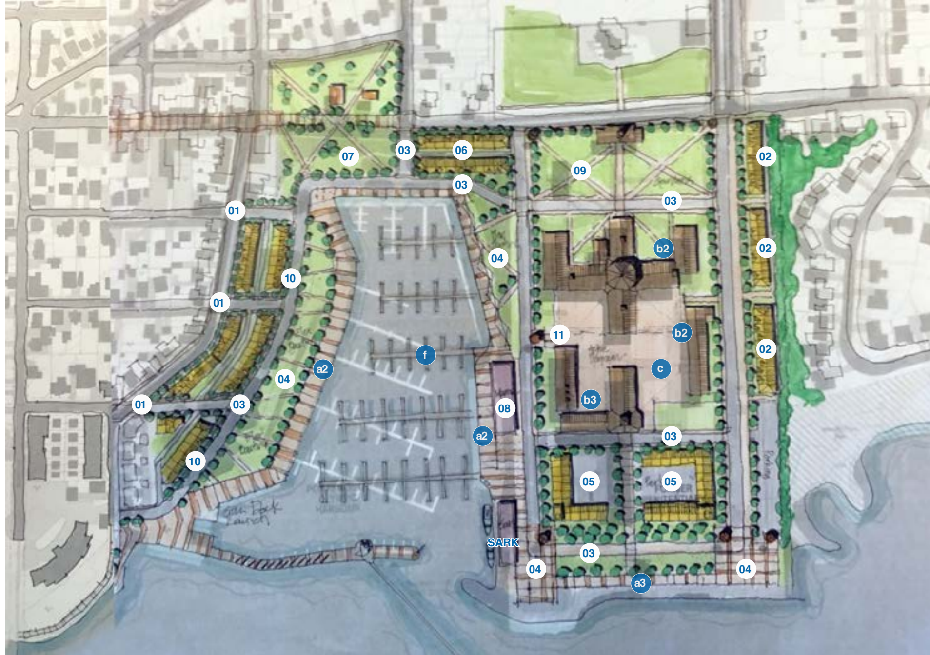
Precedents Common To All Explorations