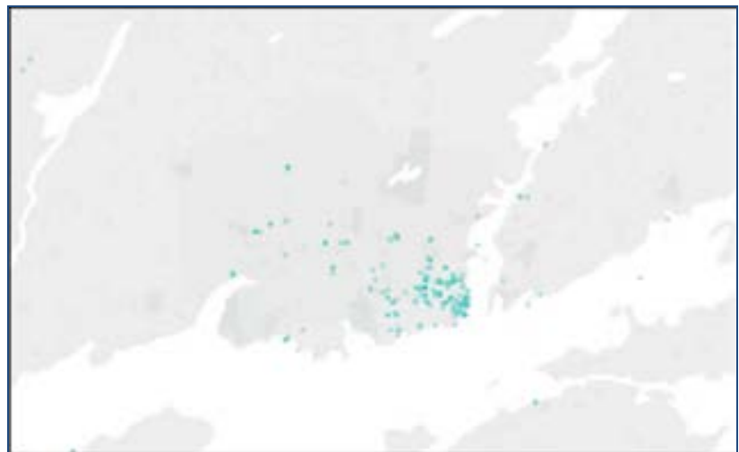
Figure 3: Location of existing Airbnb listings

Williamsville, Alwington, and Portsmouth neighbourhoods, although they are present throughout the City, as shown in Figure 3.