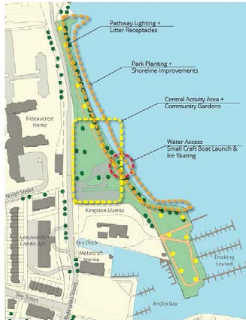
Public Feedback – Site Improvements Vision should focus on these park improvements