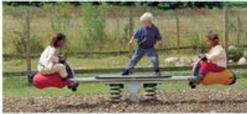
TEETER TOTTER (2-5 YEARS)