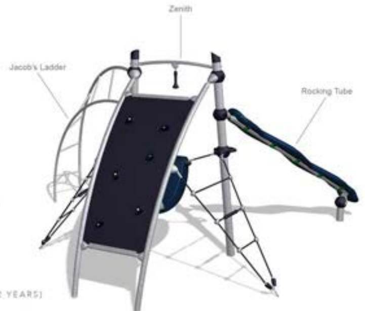
PLAY STRUCTURE (5-12 YEARS)