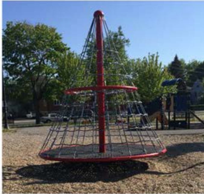
ROTATING CLIMBER (5-12 YEARS)