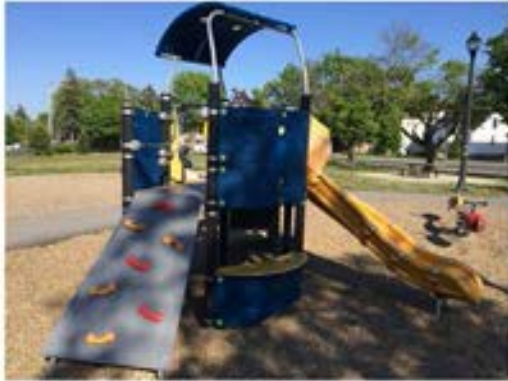
PLAY STRUCTURE (2-5 YEARS)