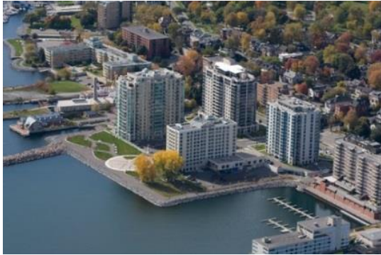
Block 'D' redevelopment (former CLC), 2010