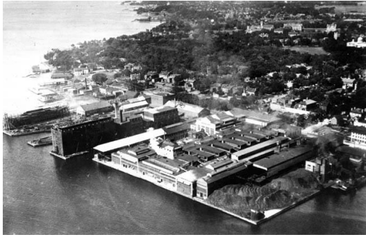
Canadian Locomotive Company (CLC), circa 1919